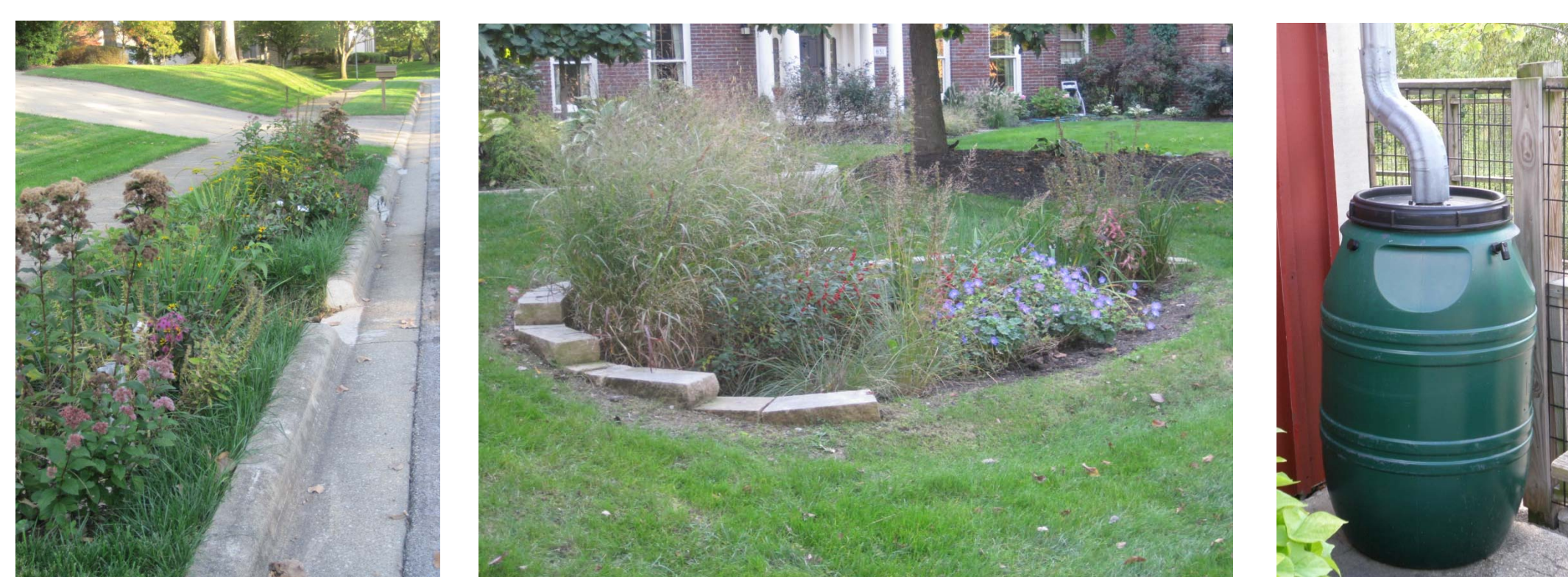
Sample of stormwater control measures available to participants of the Neighborhood Stormwater Stewardship Initiative. From left: Right-of-way bioswale, rain garden, rain barrel. Not pictured: street tree.