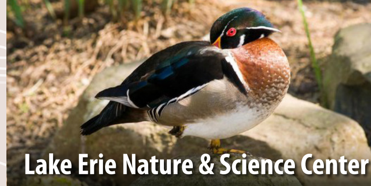
Lake Erie Nature & Science Center