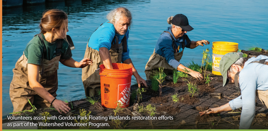
Volunteers assist with Gordon Park Floating Wetlands restoration efforts as part of the Watershed Volunteer Program.