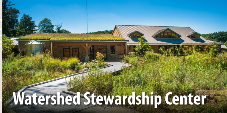
Watershed Stewardship Center