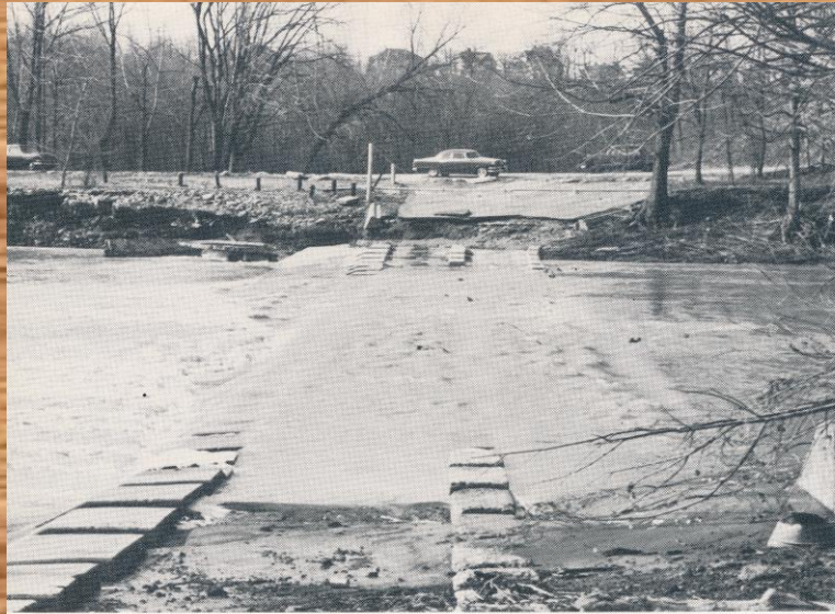
In January 1959 flood waters destroyed the old ford at Scenic Park in the Rocky River Reservation (above). By the end of the year the bridge pictured below had been engineered, built, and was open to traffic.